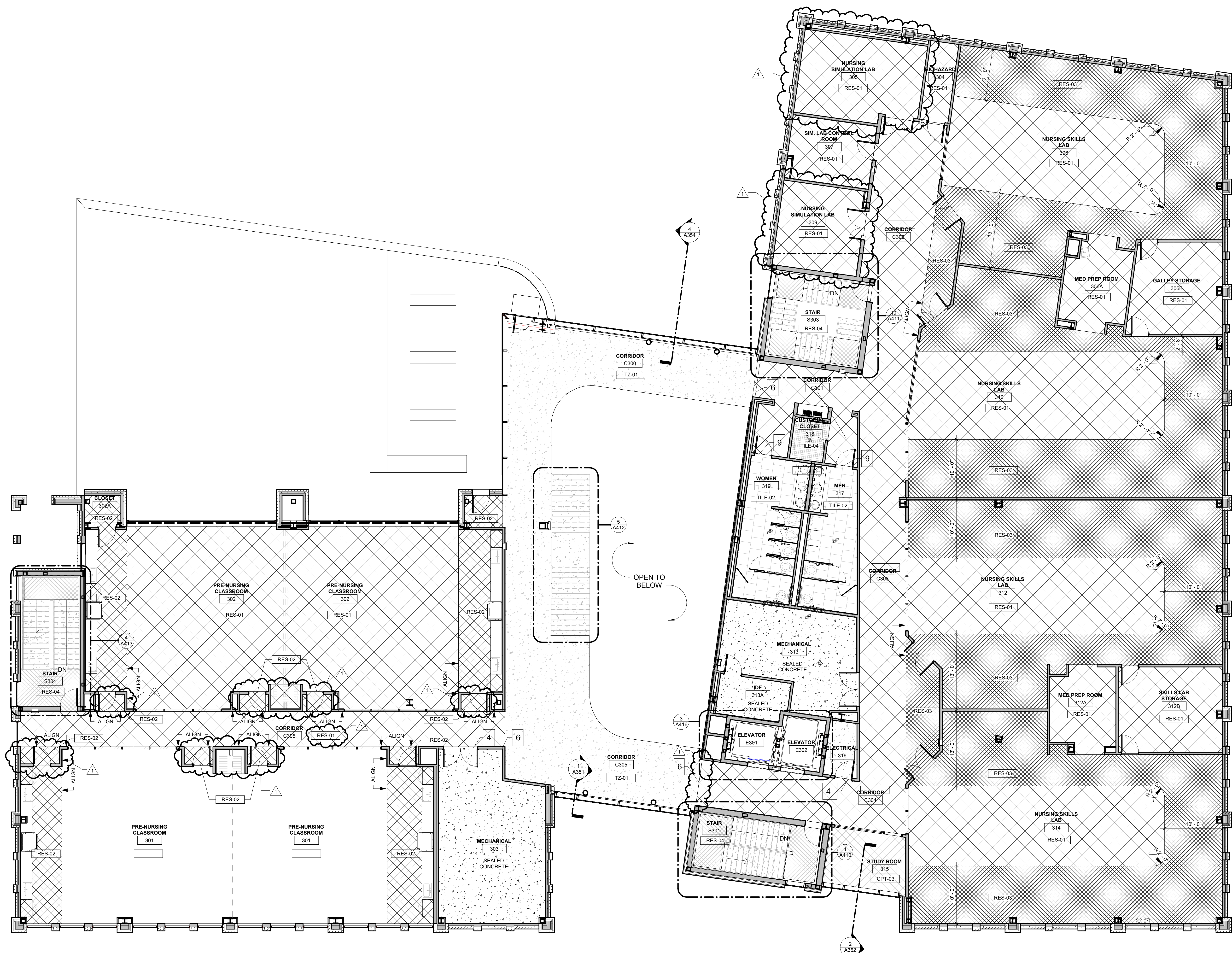
1 THIRD FLOOR FINISH PLAN 1/8" = 1'-0" | RE:1/A103